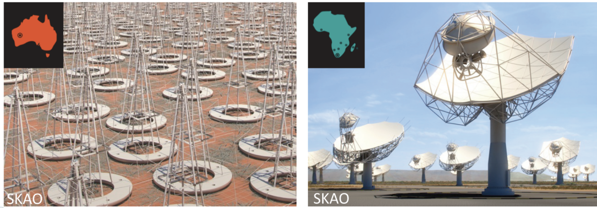
Figure 1: Artist’s conception of the SKA, with the lower-frequency radio antennas in Australia (left) and higher-frequency radio dishes (right) in South Africa. Their approximate locations on those continents is inset, with long baseline interferometry stations across the African continent also shown on the left.

These in turn will feed \sim 5 TB/s into science data processors, that will use \sim 250 Pflops to produce \sim 600 PB/yr of calibrated data products (Quinn+ 20). A network of data centres called SKA Regional Centres (SRCs) will handle the global science processing, archive and user support needs, following a tiered model like that adopted by CERN (the European Organization for Nuclear Research). The SKA is the most compute- and storage-intensive facility prioritized in the 2020 Long Range Plan, and the corresponding SRC DRI requirements for Canada are listed separately therein. Since the SRC is a vital component of Canadian participation in the SKA, the costs of the SRC will be requested as part of the broader request to Government for SKA funding in the next decade.